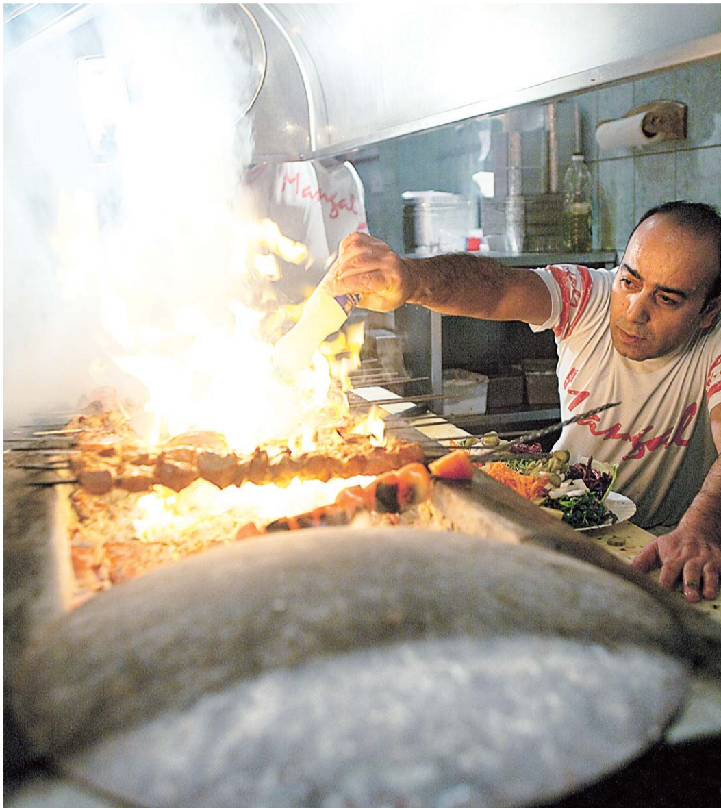
Kebabs on the grill at Mangal, a Turkish restaurant in East London.

Traditions as old as its history mix with tastes as global as its reach to make a melting pot