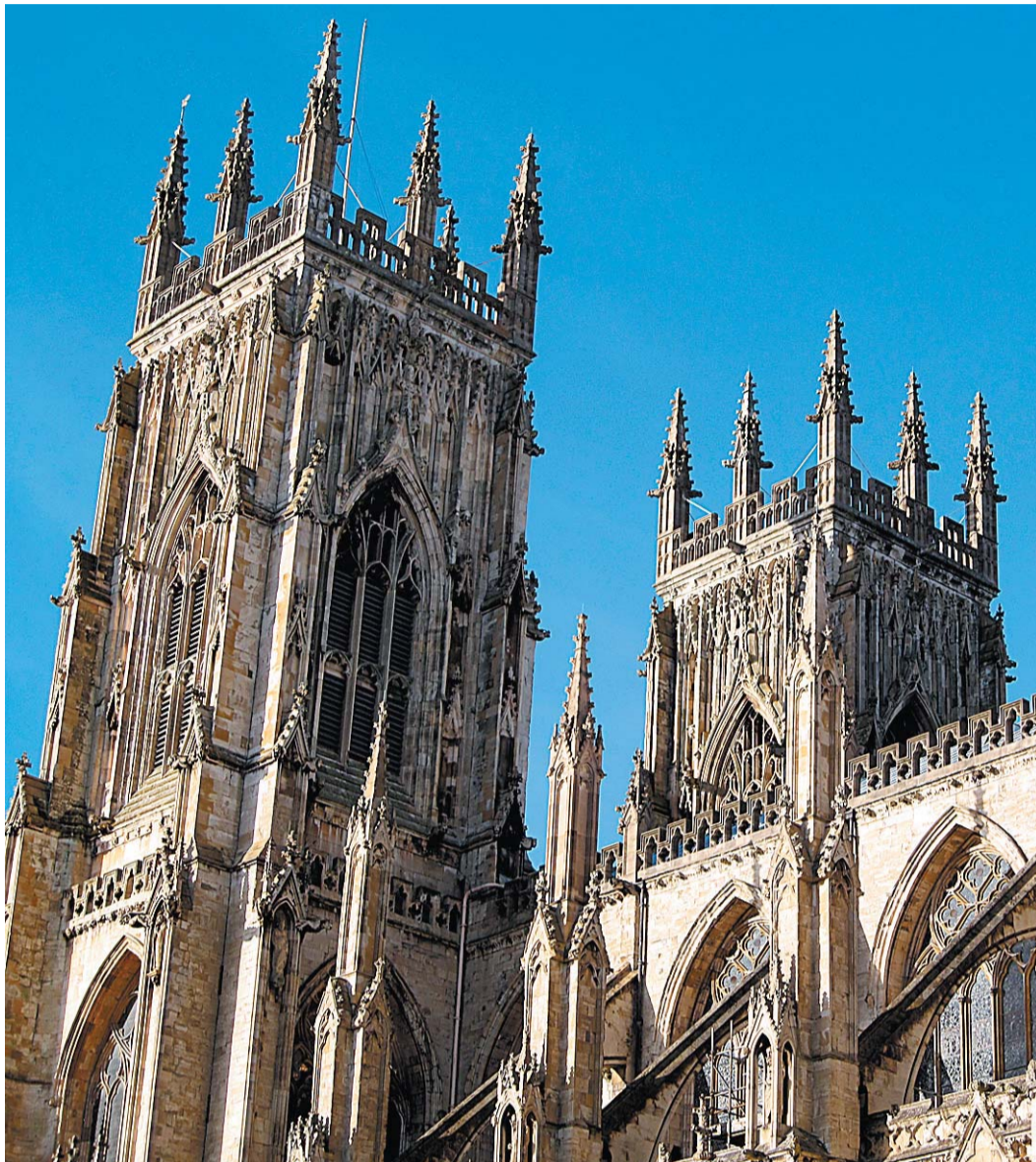
York Minster is a medieval giant of church history and architecture.