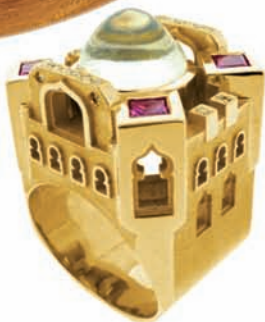
PALACE PIERRE DE LUNE

"I'm painting with stones," he says, and begins working on one of his 'metropolis' rings – futuristic representatives of his architecture series where the building tops create a canvas the size of a postage stamp. Without seeing it, the idea could reek of over-the-top tastelessness – a stamp's worth of precious stones gives a lot of space to be gaudy – yet in his hands or on the right finger, it looks like a small artist's palette where the tiny ovals, circles and geometric shapes take on a Klimt-like quality. Even here, form follows function; the highest and most exposed parts of the ring's surface (the tops of the metropolis' towers) are capped with diamonds that protect the softer stones below.