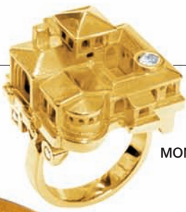
MONASTÈRE 7 DIAMANTS